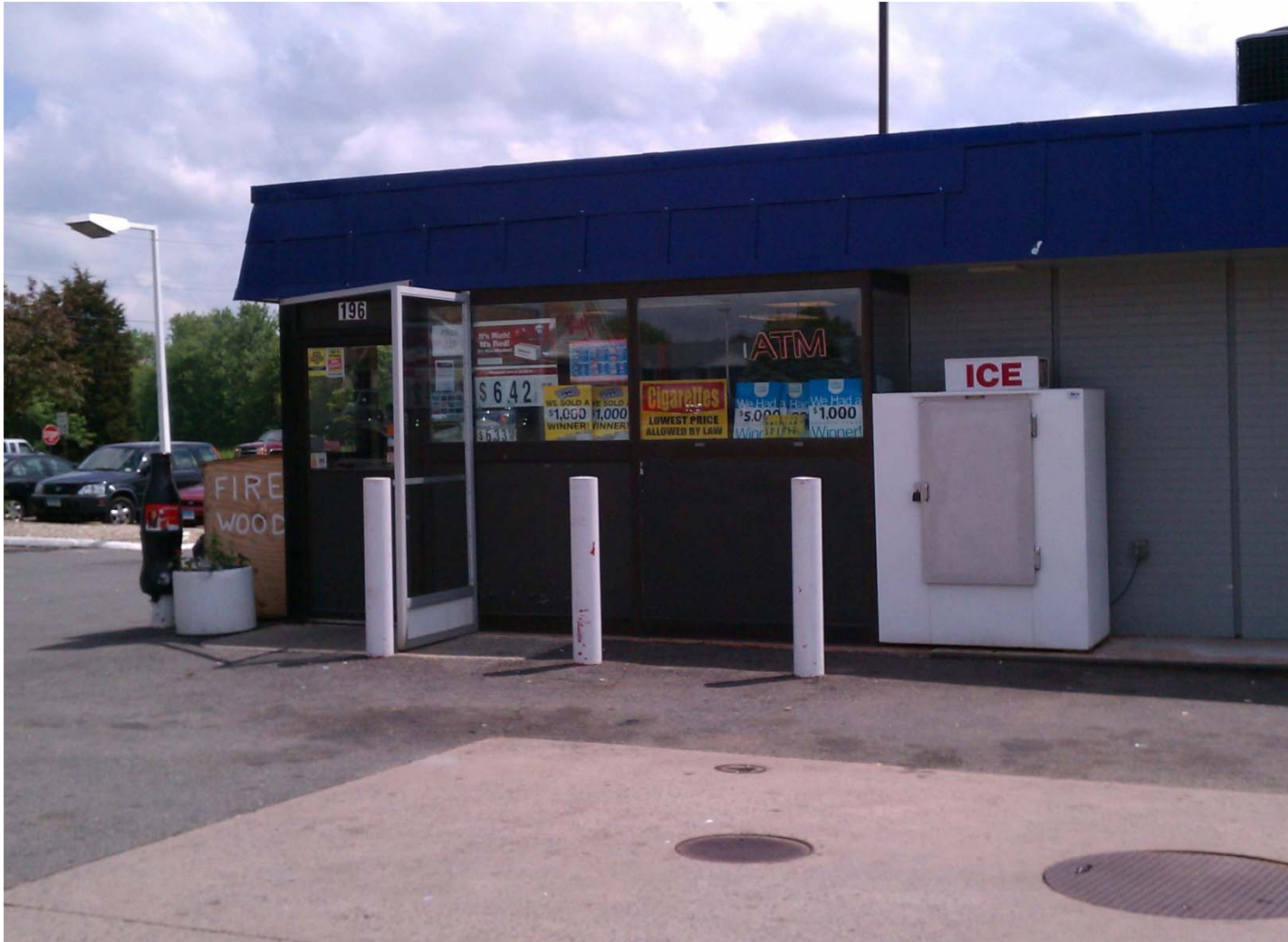
Side View of Convenience Store